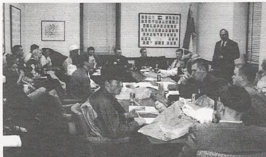
FREE Youth at the State Capitol